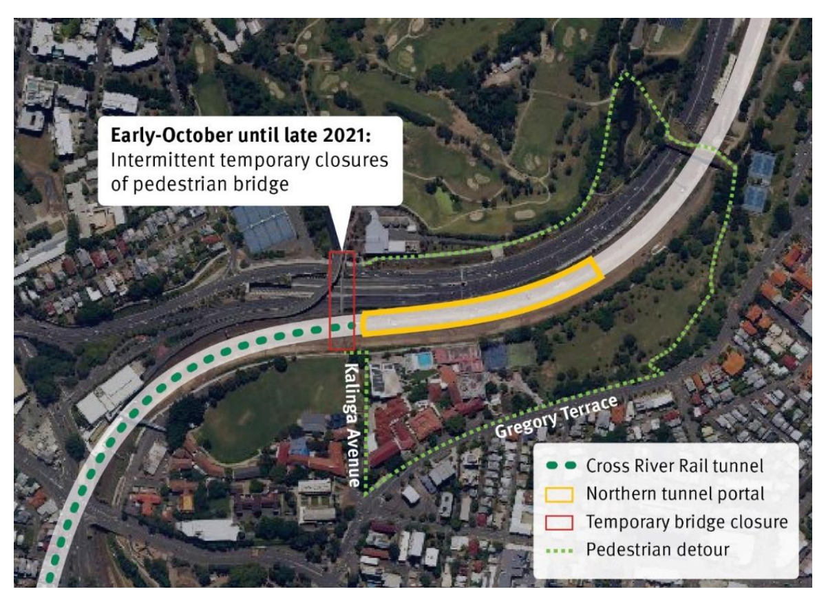
Map: Temporary intermittent closures of the rail corridor pedestrian bridge are required between early October and late 2021.